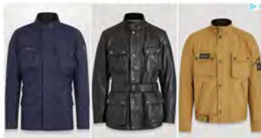
Belstaff™ Official Site Belstaff UK

Suitable for a range of fitness levels, the Hydrofoiler is powered by a 70-cell lithium-ion battery, delivering up to four hours of riding time on the lowest assist level and one-and-a-half at max. It reaches a top speed of 22km/h (13mph) and can handle moderate chop and well.