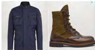
Timeless Belstaff™ Silhouettes Belstaff UK

Its main selling point may be its compact nature, but don't let its small size fool you. Reaching a depth of up to 300-metres and seating for two passengers and a pilot, this tiny submersible offers an ultra-clear acrylic hull, efficient air conditioning, and surround sound, making it the perfect yacht toy for enjoying your next luxury yacht charter destination to the max.