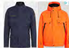
Timeless Belstaff™... Belstaff UK