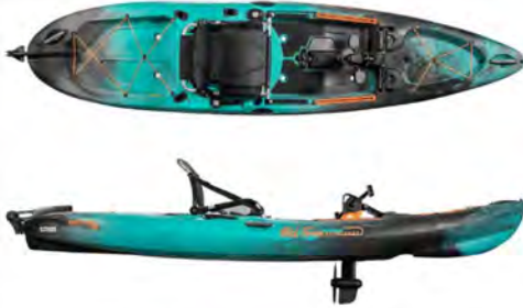
Sportsman Autopilot Kayak OLD TOWN

Awake's signature creation—the RÄVIK—is an electric surfboard that adds excitement and thrills regardless of the rider's experience. It is easily controlled via their mobile app with a top speed of 34 mph and four different power settings.