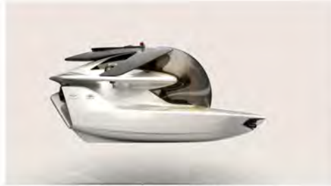
Project Neptune collaboration between Aston Martin and Triton Submarines