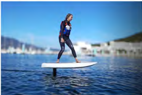
Waydoo Flyer E foil WAYDOO

The IAQUA dive scooter can be used on top and underwater. With a top speed of 13 mph, it is able to reach depths of 100 feet and last for 80 minutes. Made entirely of carbon from sports car construction, it is lighter and crack-resistant.