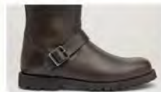
Belstaff™ Official Site Belstaff UK

The Waydoo Flyer ONE's 6,000W motor can propel it at speeds of up to 25 mph, and the company boasts a ride time of 55-85 minutes. Once the waterproof battery runs out, it can be removed and recharged in two hours. A handheld wireless controller with a trigger throttle allows the rider to control their speed. The bodyweight movements of the operator maintain the balance.