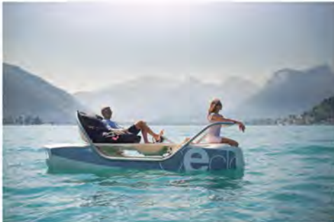
Ceclo Electric Hybrid catamaran | CECLO

Candela's latest 28-foot hydrofoil electric tender, the C-8, is the first electric day cruiser with long-range at high speeds and will reach top speeds of 35 mph and exceed 50 nautical miles. With 80% less energy consumption thanks to its hydro foiling technology, Candela C-POD direct-drive pod motor will allow it to cruise for a range of 50 nautical miles on battery power at a speed of 25 mph. The tender features a large cockpit, seating for eight passengers, a sunbed, and a front cabin that can sleep two adults and two children.