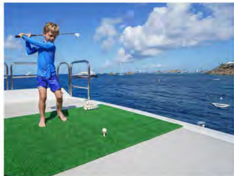
FunAir Golf MOTOR YACHT LOON

Unlike typical Triton submersibles, which use a neutral, flat dive attitude, Project Neptune has been engineered to tilt as it dives and carve smooth, sweeping arcs as it turns, echoing Aston Martin's sports cars.