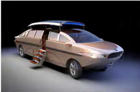
Nouvoyage Amphibian Tender in and out of the water from your megayacht | NOUVOYAGE

Ceclos are luxury electric pedal boats designed for exercise and relaxation for those quiet escapes away from the yacht. Utilizing a pedal system that is electrically assisted helps you move faster and travel farther while experiencing complete silence—great fun for exploring hidden coves and beaches while anchored.