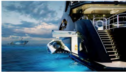
U-Boat Worx NEMO submarine

Every year I am excited to compile my favorite superyacht toys that will be offered up at the Monaco Yacht Show where thousands of yacht fans descend on Port Hercules to see the most exciting new yachts and toys as well as more than 300 exhibitors.