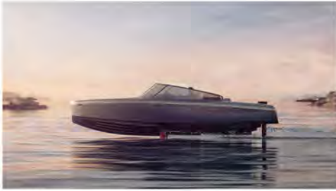
Candela C-8 Hydrofoil Electric Tender | CANDELA

A giant multi-person board over five meters long and 16 feet wide, the Ride XL paddleboard can carry up to eight people. With an inbuilt sturdy iFin system, the board is resistant to damage and is the perfect vessel to explore quiet coves from your yacht. With several air valves, you can get your guests out on the water fast.