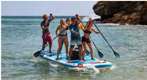
Red Ride XL for group excursions | RED PADDLE CO.