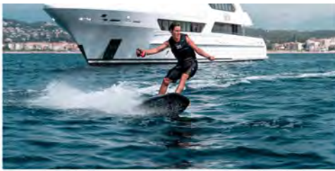
Awake RÄVIK S electric surfboard AWAKE