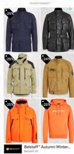
Belstaff Autumn Winter... Belstaff UK