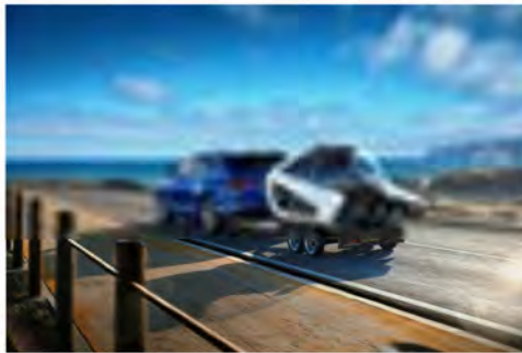
Lightweight NEMO submarine can be towed anywhere U-BOAT WORX

With a wide selection of submarines, toys, and futuristic tenders available to purchase, captains and yacht owners continue to explore new ways to entertain their families and guests while on board. Please enjoy my list of the coolest (and often outrageous) toys and tenders for 2022.