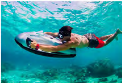
IAQUA Sea Dart Max IAQUA

This advanced sports kayak uses a 12V Minn Kota propellor motor, eliminating the need for paddling and utilizing foot steering for the ultimate fishing experience. The Kota's Spot-Lock technology, activated using the i-Pilot Bluetooth connected remote, automatically keeps the kayak steady in position, regardless of wind or current, to make a yacht fishing trip enjoyable for your guests.