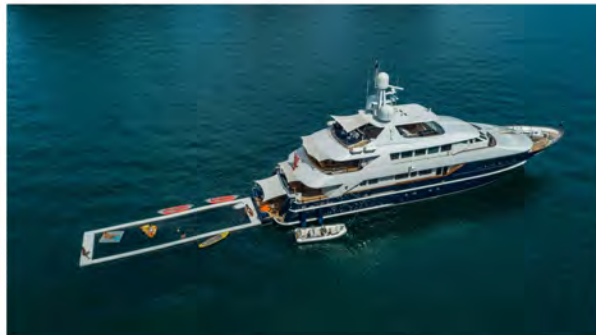
Lady Azul and her 'XL' sea pool

Courtney tells Asia-Pacific Boating that FunAir regards Asia-Pacific as a rapidly growing sector of the superyacht market. "Not only are we seeing more boats travelling to that region but also more based there permanently," he says. "MY Lady Azul is a favourite of ours. She recently added an extra-large sea pool to her portfolio and charters in Asia. They often visit areas that have only recently opened up to yachting, like Myanmar or the Mergui Archipelago, which are stunning locations that retain their natural beauty."