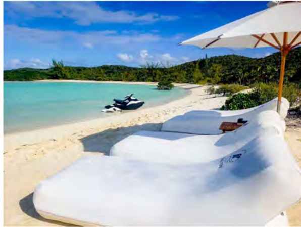
Beach loungers ready for action

into one or two tender rides to shore. Guests and owners love the additional comfort the inflatable loungers give, especially when paired with our custom covers, which can be embroidered with the yacht's logo or a design of their choice. We are in the final design stages for an inflatable beach chair to add to this range, which will be launched in 2021."