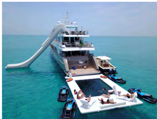
Loon's custom-made beach club sea pool

In 2018, luxury superyacht Loon became an Instagram sensation. But it wasn't the 47-metre Christensen-built charter herself that attracted attention on the social media platform. Instead, it was the yacht's inflatable sea pool – placed prominently in most of its promotional images – that captured the clicks and imaginations of millions around the world.